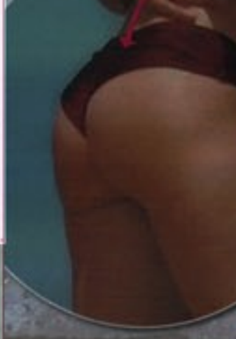
MENA'S BEHIND IS PERFECTLY PERKY!

"She has one of the best butts in Hollywood," says Dr. Rey about Mena Suvari's natural beach body. "She has a very athletic and youthful behind, with no sagging at all." So it's no surprise people want rears just like hers. Explains Dr. Rey, "Some of my patients request a butt they can set a tray on — and Mena has exactly that!"