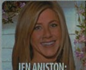
JEN ANISTON: HAVING MORE SURGERY FOR JOHN?