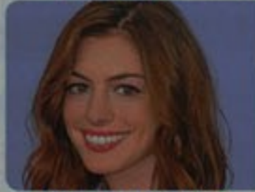
ANNE HATHAWAY'S NEW LOVE