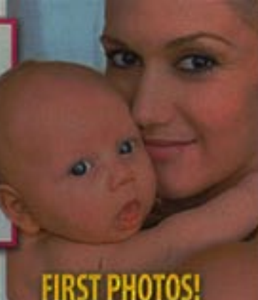
FIRST PHOTOS! GWEN STEFANI INTRODUCES HER SON ZUMA

Is it too soon for a comeback? Britney breaks down as she's forced to leave her kids for her career PLUS: WILL SHE BE ON DRUGS FOR THE REST OF HER LIFE?