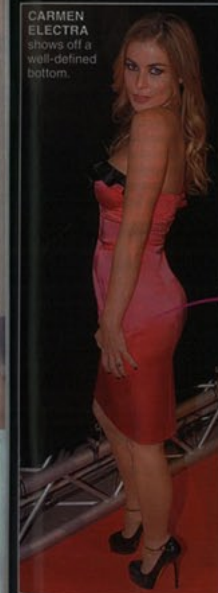
CARMEN ELECTRA shows off a well-defined bottom.