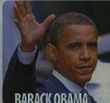
BARACK OBAMA MADE HIS GRANDMA PROUD