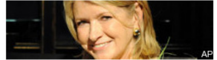
Martha Stewart Axes 25 Staffers