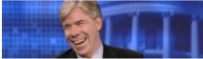
David Gregory Explains MSNBC Strategy: "There Can Be A Little Repetition"