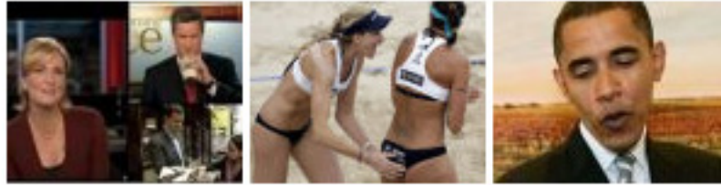
More in Media: Morning Joe Anniversary... Beach Volleyball: TV Hit!... WSJ Pro-Obama Op-Ed...